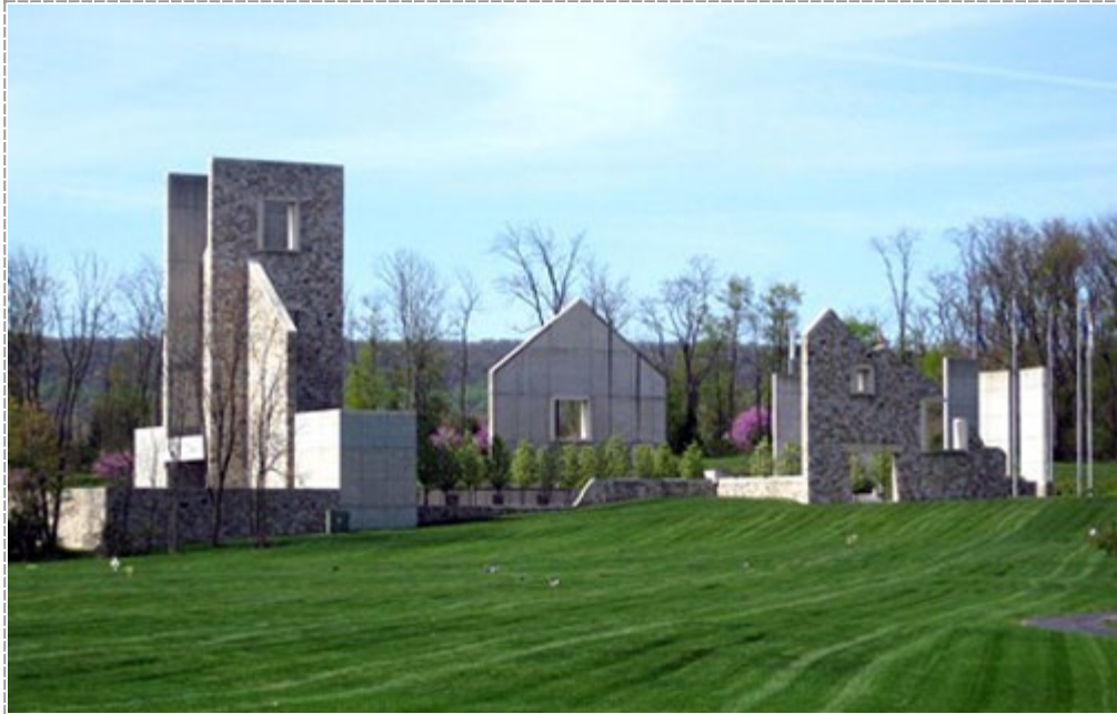
Pennsylvania Veterans' Memorial, Fort Indiantown Gap National Cemetery