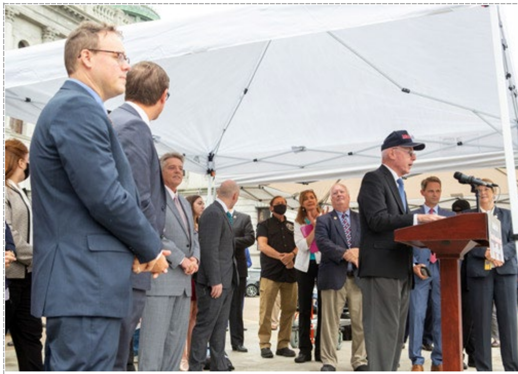
I am pictured speaking at the Second Amendment Rally at the state Capitol in 2020.

The Rally to Protect Your Right to Keep and Bear Arms will be held on Monday, Sept. 12, at 10 a.m. on the front steps of the state Capitol building in Harrisburg . This is an event I look forward to attending each year. It's encouraging to see so many people united in their mission to protect this important and revered constitutional right. Please join us in making sure our voices are heard. This event will be held rain or shine. I look forward to seeing you there!